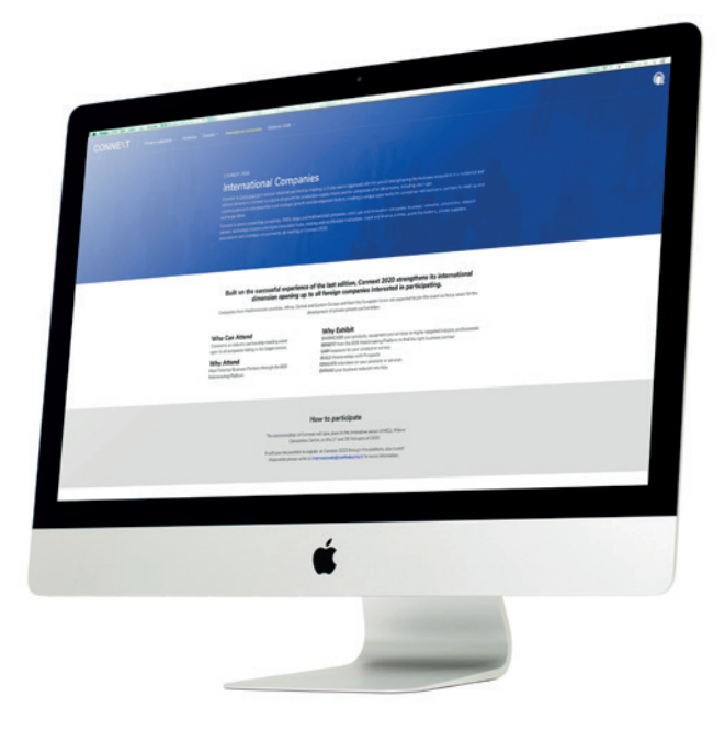
Find more on connext.confindustria.it/international